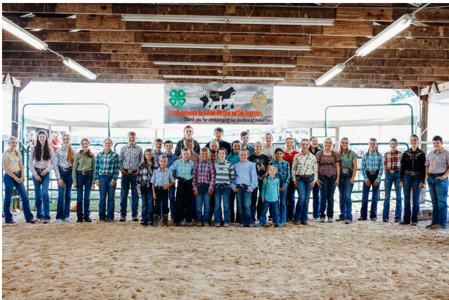
Livestock exhibitors at the 2024 Highland 4-H & FFA Livestock Show and Sale.