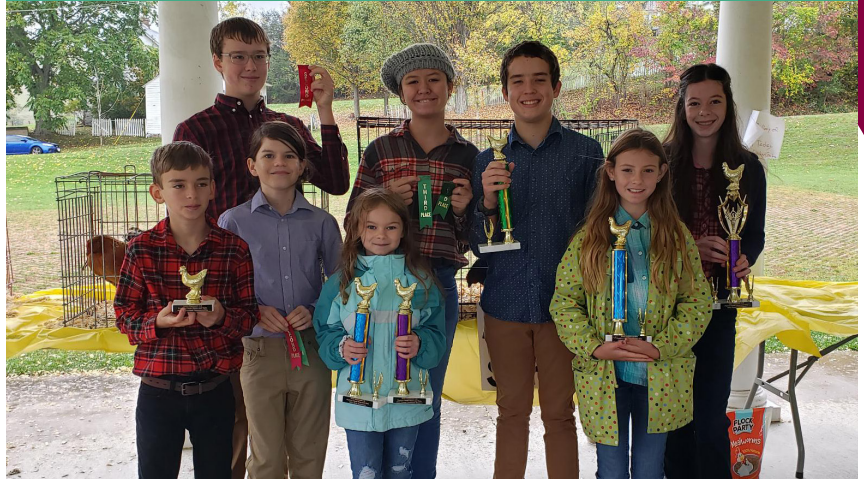
Participants at the 2021 Bath-Highland 4-H Poultry Chain Show and Sale display their awards.

Due to COVID-19 restrictions in 2020, a Bath-Highland 4-H Poultry Chain was created to give youth an at-home 4-H project opportunity that allowed for safe social distancing and a hands-on experience. Seven youth began the program in 2020 but were unable to participate in a show and sale due to restrictions on people gathering. In April 2021 the program reopened registration with the promise of a fall show and sale. Twelve youth received 125 chicks to raise and signed an agreement to participate in educational programs and complete a 4-H poultry record book by the end of the program. They also agreed to show and sell five mature chickens at the end of the program in the required show and sale component of the program. The event at which youth would show and sell their chickens would be the Bath County Fair, which was canceled due to COVID-19. 4-H agent Kari Sponaugle and Extension agent Berkeley Clark Cassady rallied quickly for an alternative show and sale option.