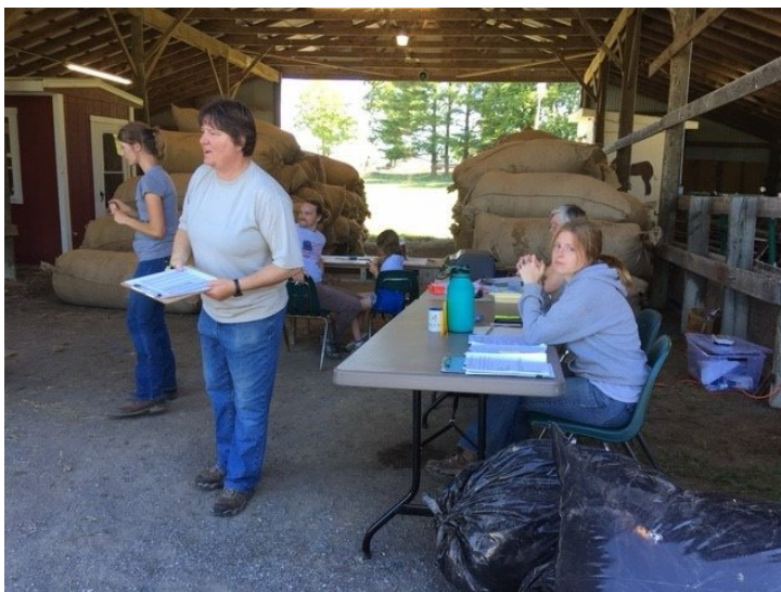
Set up to assist Wool Producers fill out FSA paperwork at the 2021 Highland Wool Pool.